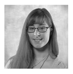
Calendar Title: 'Merry Mayhem'