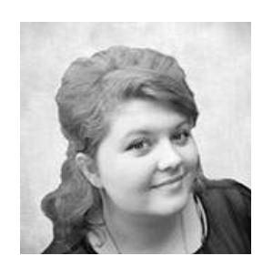
Calendar Title: 'Santastic'