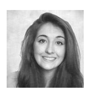
Calendar Title: 'Tis the Season to be Jolly'